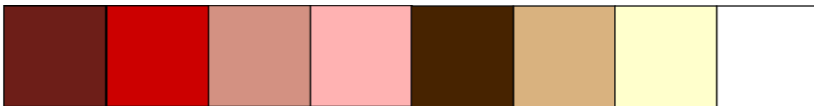
Burgundy Red Rose Pink Brown Sandalwood Ivory White