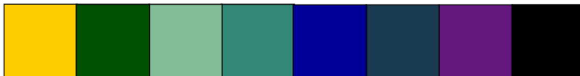
Mustard Forest Seafoam Teal Blue Navy Purple Black

** All napkin colors are not always available.