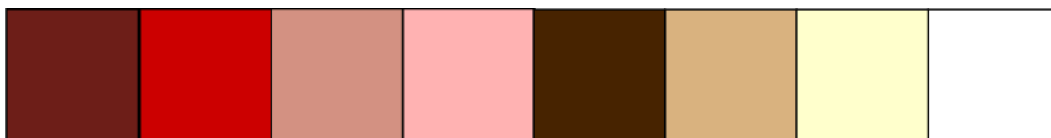
Burgundy Red Rose Pink Brown Sandalwood Ivory White